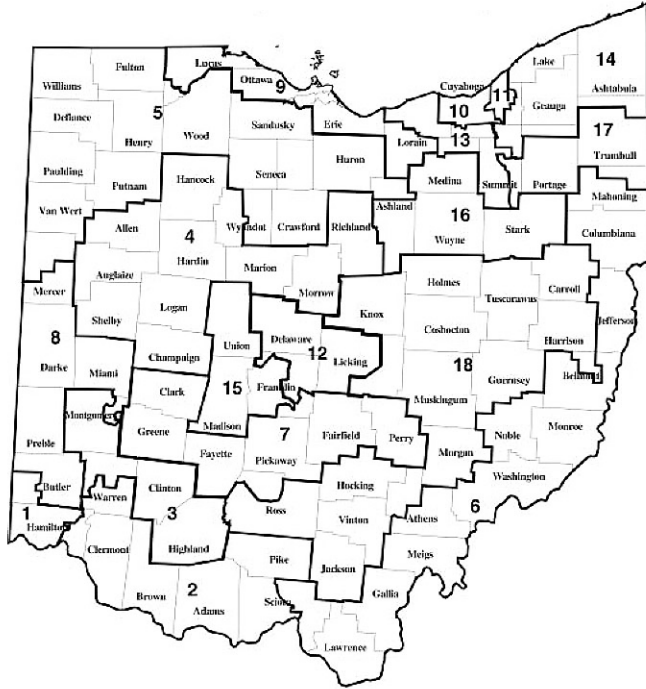
MAP 1: U.S. Congressional Districts