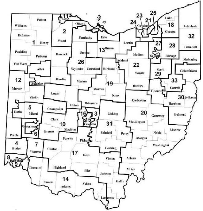
MAP 2: Ohio Senate Districts